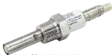
Model 400 ENDURANCE Sensor