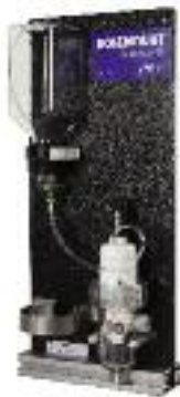
Model 3200HP High Purity pH Sensor

Corrosion and deposition in the turbine are caused by mechanical and vaporous carryover of boiler water into the steam. Because the contaminants are primarily ionic, monitoring boiler water conductivity with a Model 400 sensor and deconcentrating, if necessary, is an easy and inexpensive first step toward controlling steam purity. Many plants regularly monitor specific impurities. Sodium is a particularly hazardous corrodent and can be measured using the Model 185 sodium analyzer. Silica, a major component of turbine deposits, is not ionic and can be measured directly using the Model 185 wet chemistry analyzer.