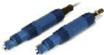
Model 3900 General Purpose pH Sensors