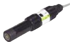
Model 499A TrDO Sensor