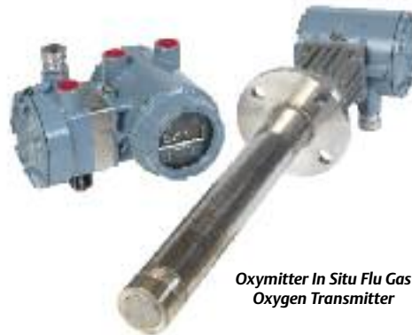
Oxymitter In Situ Flu Gas Oxygen Transmitter

The most widely used technology for measuring combustion flue gas is the zirconium oxide fuel cell oxygen analyzer. The Rosemount Analytical Oxymitter utilizes this proven technology, integrating it with field electronics into a single, compact package. Its probe inserts directly into a flue gas duct to measure oxygen in combustion processes – no sampling system is required. The Oxymitter electronics also require 95% less power to operate, so the components last