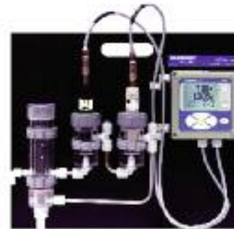
FCL/MCL Free Chlorine Systems