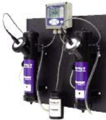
Clarity II™ Dual-sensor Turbidimeter

Blowdown also reduces the concentration of treatment chemicals. The programmable bleed and feed relays in the Model 56 Analyzer make it easy to automatically replenish treatment chemicals every time the system is blown down. Sulfuric acid injection is usually controlled by measuring pH. The Model 396P or Model 3500 are the sensors of choice. Both resist fouling, and the Model 3500 has the additional advantage of being rebuildable.