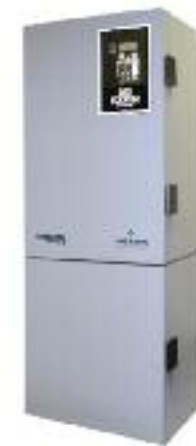
Model 185 Wet Chemistry Analyzer