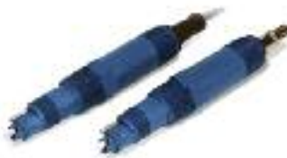
Model 3900 General Purpose pH Sensors