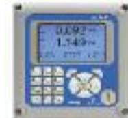
Model 56 Analyzer