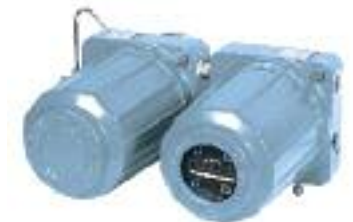
OCX 8800 O 2 / Combustibles Transmitter