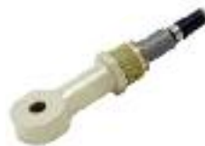
Model 228 Submersion/Insertion Sensor