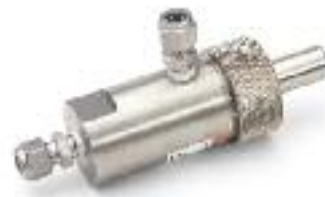
Model 404 ENDURANCE Sensor