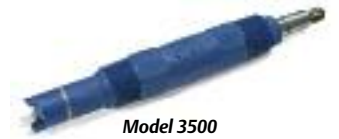
Model 3500 Insertion/Submersion pH/ORP Sensor