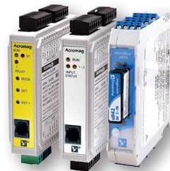
Limit Alarms / Computation