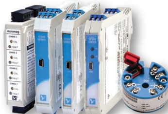
Transmitters, Isolators, Splitters