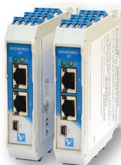
Ethernet, Modbus, Profibus I/O